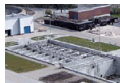
Oldenburg - microplastics