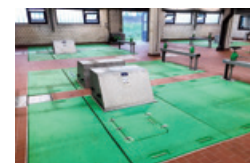
Sankt Augustin - low TSS & phosphorus

Mecana Umwelttechnik GmbH www.optifibermedia.com CH-8364 Reichenburg | T +41 55 464 12 00 | www.mecana.ch | info@mecana.ch