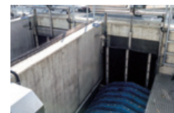
Wendlingen - micropollutants