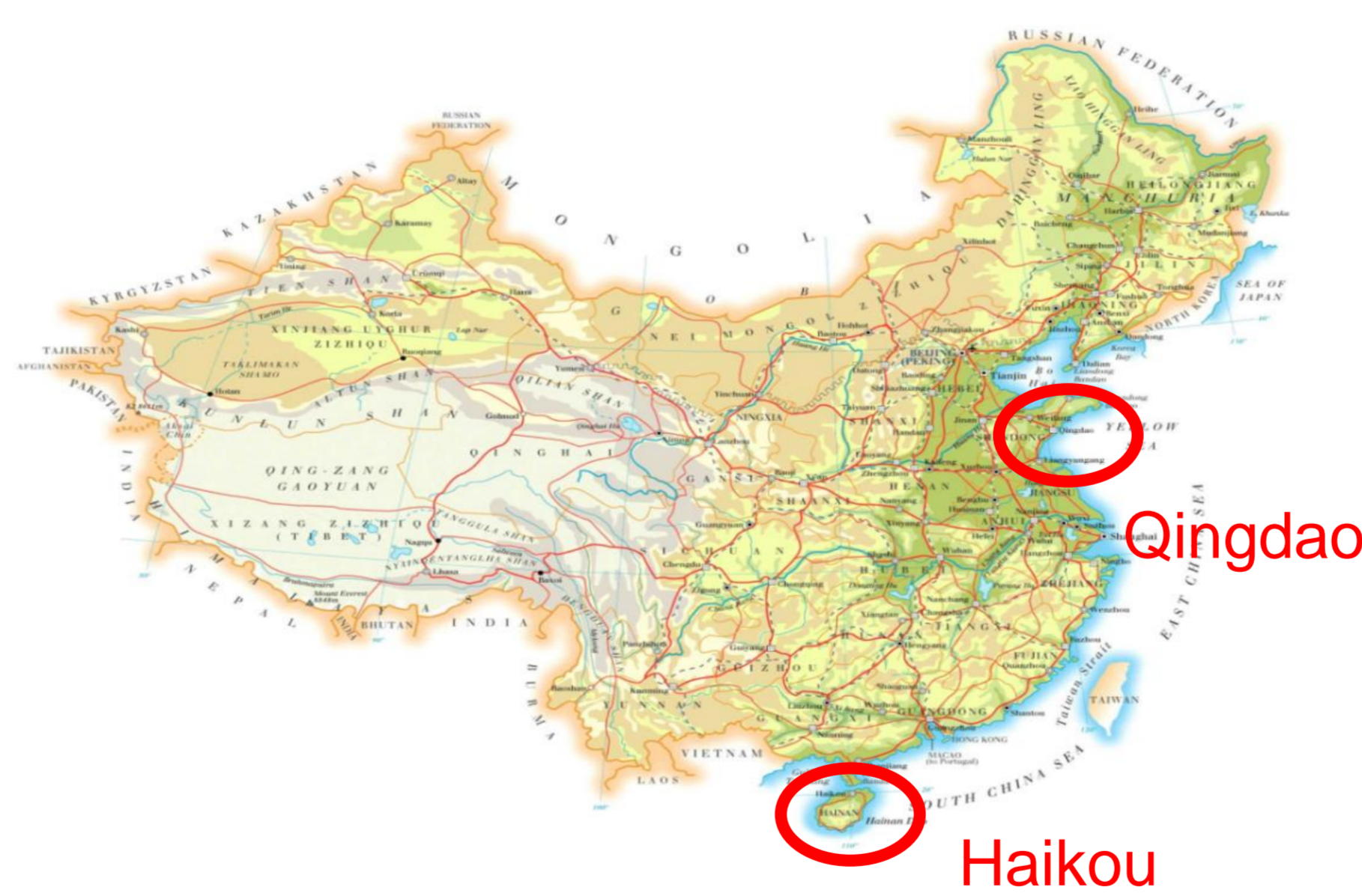
Figure 2 project locations (adapted from http://www.hoekmann.de/karten/asien/china/index.htm )

In previous research projects, the new design approach was validated using semi-industrial scale aeration tests under defined conditions with drinking water. As part of a current research project a validation of the approach is conducted at industrial scale plants. Therefore experiments are carried out on WWTP with high and relatively low wastewater temperatures as well as elevated salt concentrations: WWTP Baishamen in Haikou and WWTP Licunhe in Qingdao, both China (see figure 2).